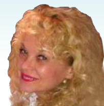
Anzhelika Izotova Deputy Director of the Department of the markets studies and investigations in production, pharmaceuticals and retail Antimonopoly Committee of Ukraine