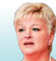
Olena Matveeva Deputy Head Expert Committee on the Selection and Use of Essential Medicines Ministry of Health of Ukraine